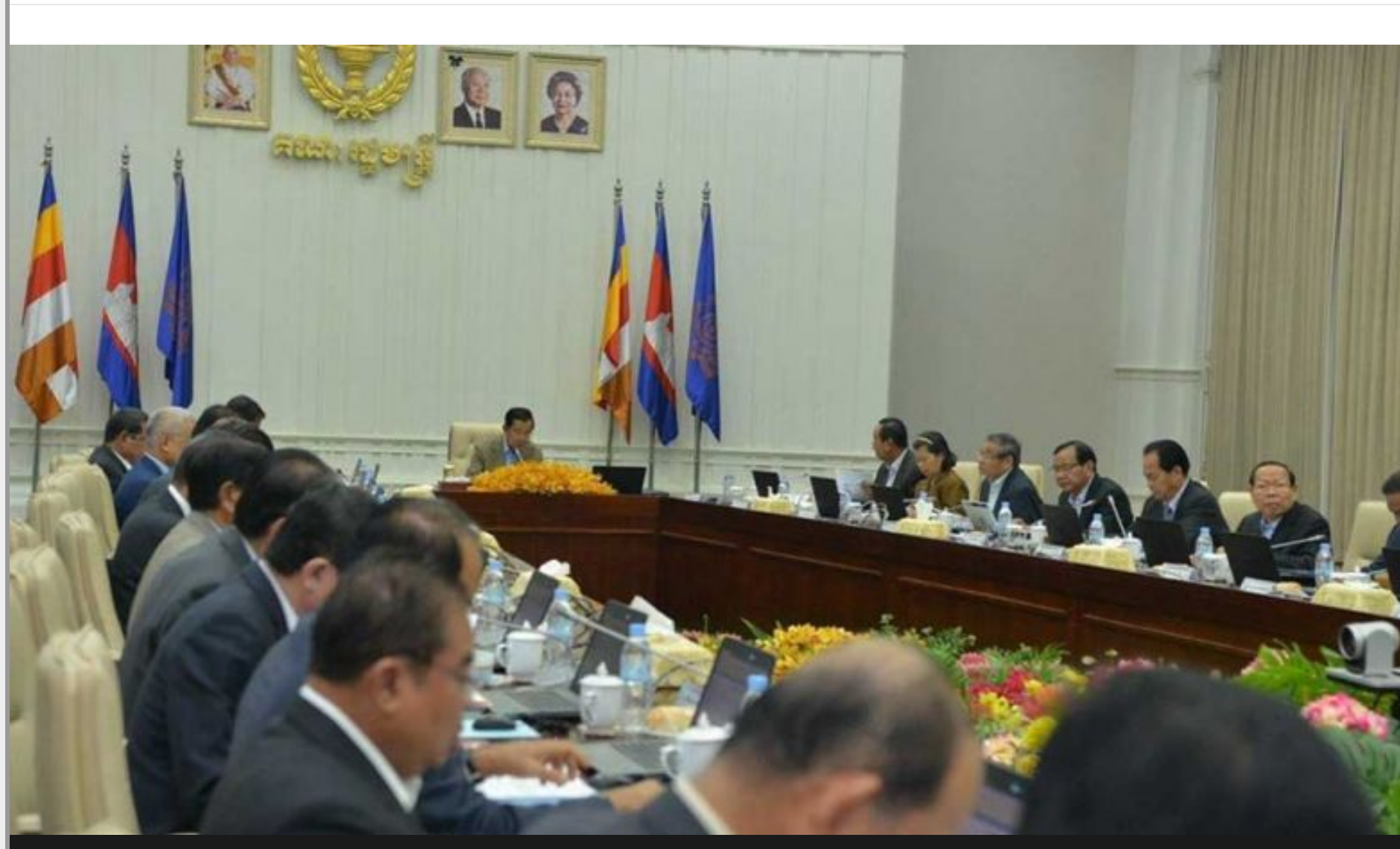
Prime Minister Hun Sen chairs a plenary meeting of the Council of Ministers at the Peace Palace on Friday where the council approved two coal-fired power plant projects and a transmission line worth nearly $1.7 billion.

Hin Pisei | Publication date 09 February 2020 | 22:13 ICT Share Facebook Twitter