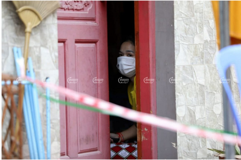
A garment worker is shown quarantined in her rental room after her roommate tested positive for Covid-19, on March 17, 2021.