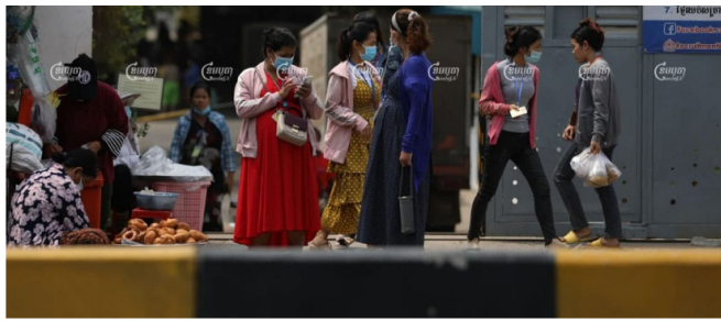
Garment workers buy food in front of the Trax Apparel factory, one day after a factory guard was brought to the hospital upon testing positive for Covid-19, March 17, 2021.