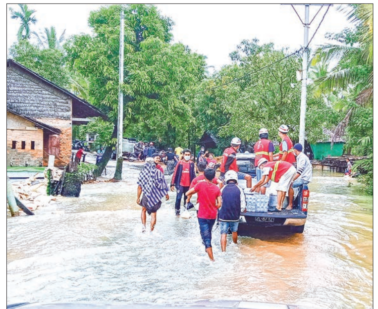
Rescuers evacuate local people from flooded area to safer places.