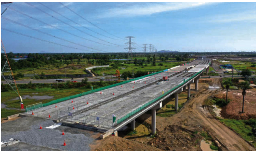
A view of the progress towards completion of the Phnom Penh-Sihanoukville Expressway.

"This project is very beneficial to our Cambodian workers because it provides them with technical know-how on the construction of an expressway and we hope that after the project, they will be able to use their knowledge to help build other expressways in Cambodia," he said.