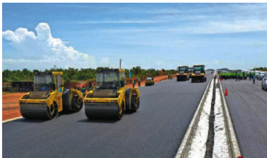
A view of the progress towards completion of the Phnom Penh-Sihanoukville Expressway. Ministry of Public Works and Transport